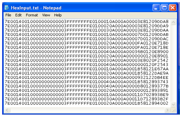
Figure 4. Input from WSN

This paper presents the results of the investigation of using CEP in WSN for object tracking application. The preliminary